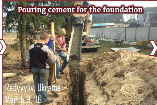
Pouring cement for the foundation