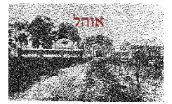
Pre-war photo of the ohel aids in discovery of the foundations