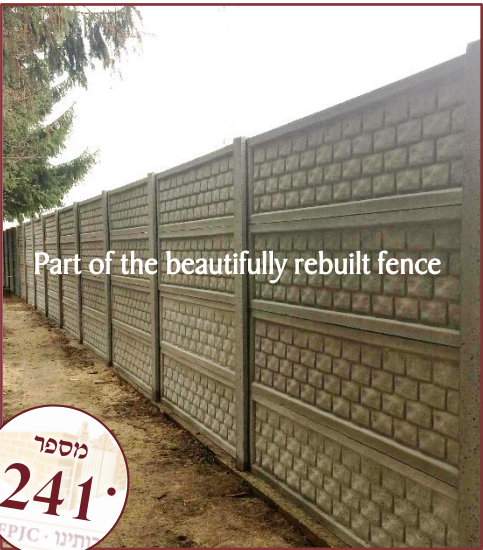
Part of the beautifully rebuilt fence