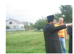
2012: Rav of Brod visiting the cemetery with Avoyseinu members