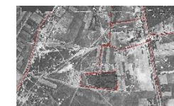
The ohel and the borders of the cemetery discovered by perusing old maps