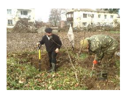
Avoyseinu members in search of the borders of the cemetery and the holy ohel