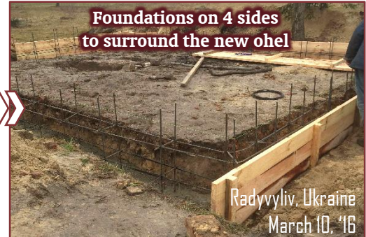
Foundations on 4 sides to surround the new ohel