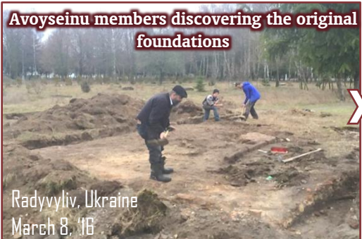
Avoyseinu members discovering the original foundations

After years of intense negotiations by the grandchildren, headed by the Rav of Brod Shlit"a and Avoyseinu members, we finally received permits to build the fence | We express our thanks to the local populace for their assistance | After much effort we were successful in ascertaining the exact borders of the cemetery | A strong and durable fence is now being erected, made possible by the generosity of esteemed patrons | We hope to complete the fence and restoration of the ohel with the continued support of these donors.